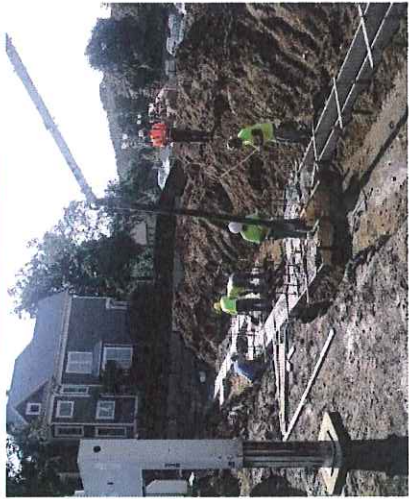
Pouring of concrete foundations through pump truck