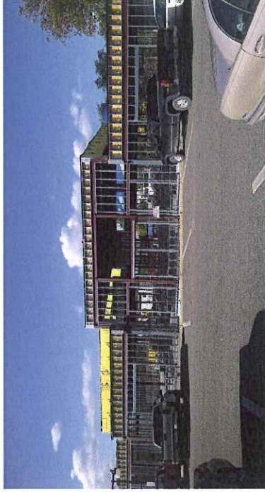
Exterior framing & sheeting on-going