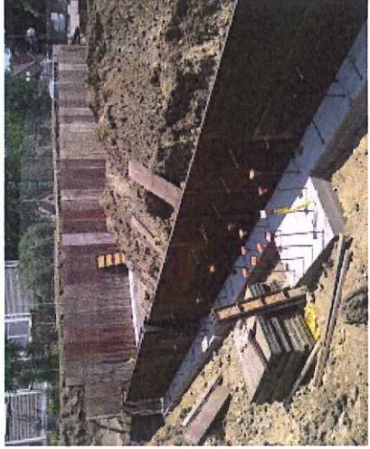
Forming of concrete foundation walls