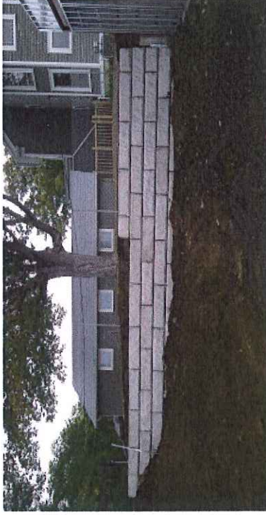
Retaining wall installation