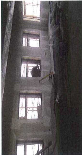
Drywall, taping & sanding