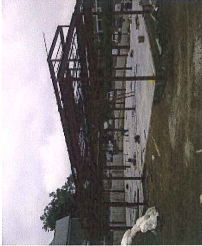
Joists being installed