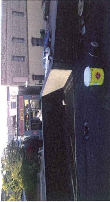
Roofing work started