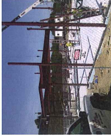
Steel erection begins