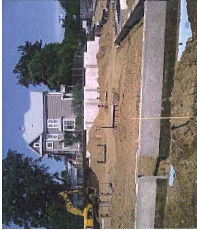
Site view – Project now above ground